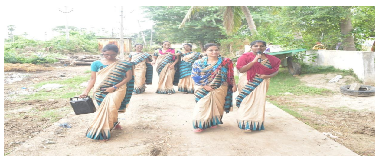
International Women's Day Celebration

Narayana College of Nursing celebrated International Women's Day on 8th March 2020 with great enthusiasm to promote gender equality and honor the achievements of women. The event aimed to raise awareness about women's rights and the importance of educating the girl child for the development of society.